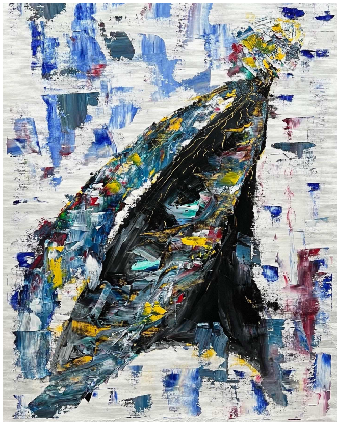
'I'm out' A3, oil