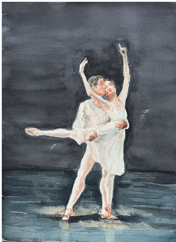
'Dance of Joy' 24x32 cm, watercolour