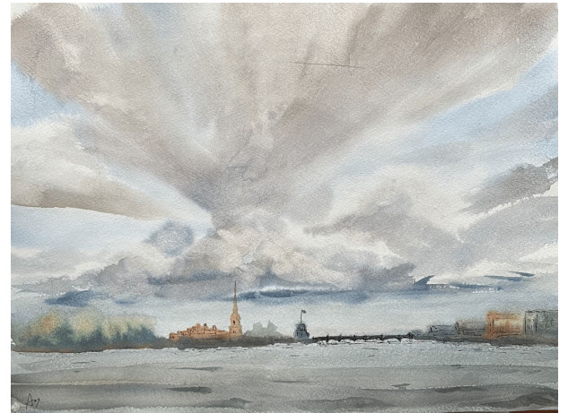
'SpB clouds' 30x40 cm, watercolour