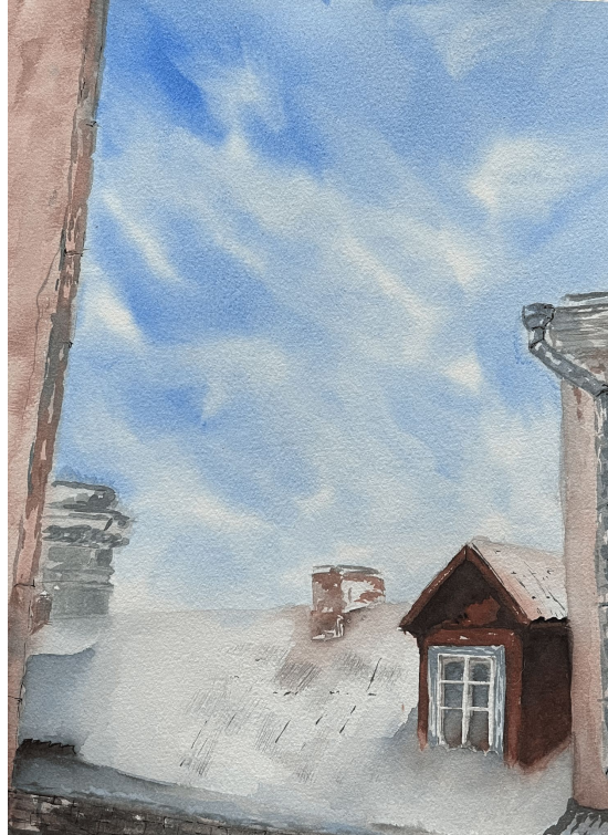
'Window to the sky' 24x32 cm, watercolour