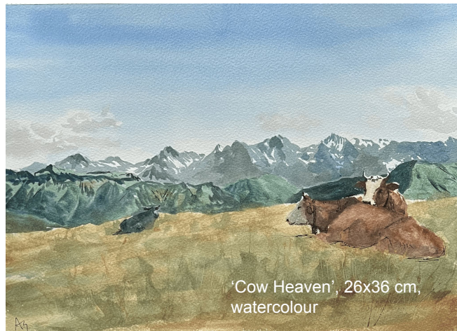
'Cow Heaven', 26x36 cm, watercolour