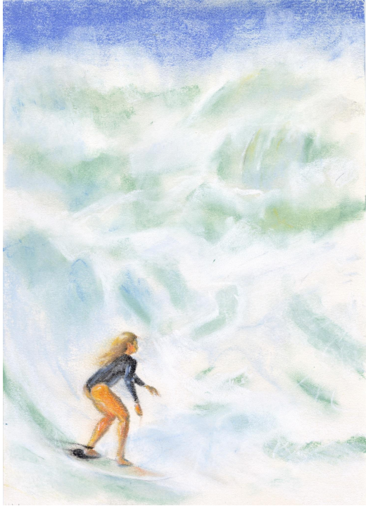
'On the wave #5' A4, soft pastel