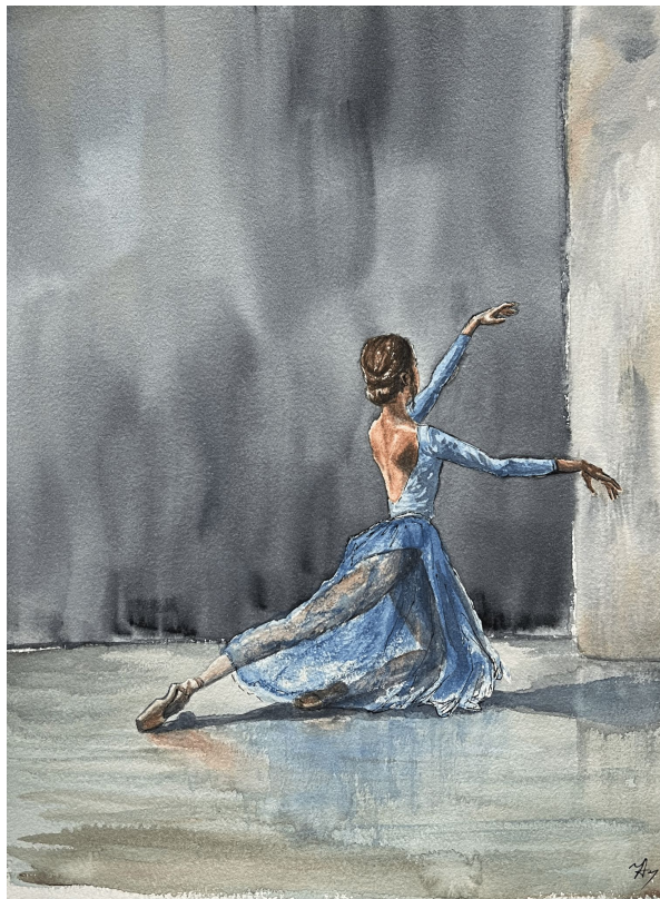
'Ballerina in a blue dress' 24x32 cm, watercolour