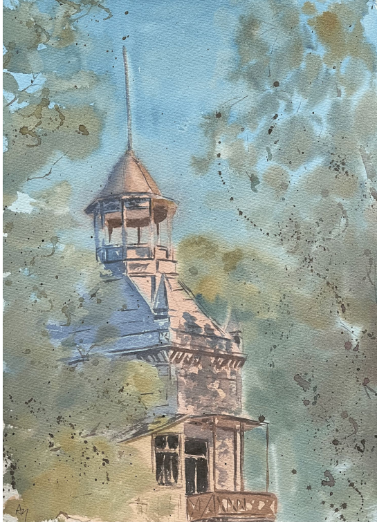
'Villa Kivi' 26x36 cm, watercolour