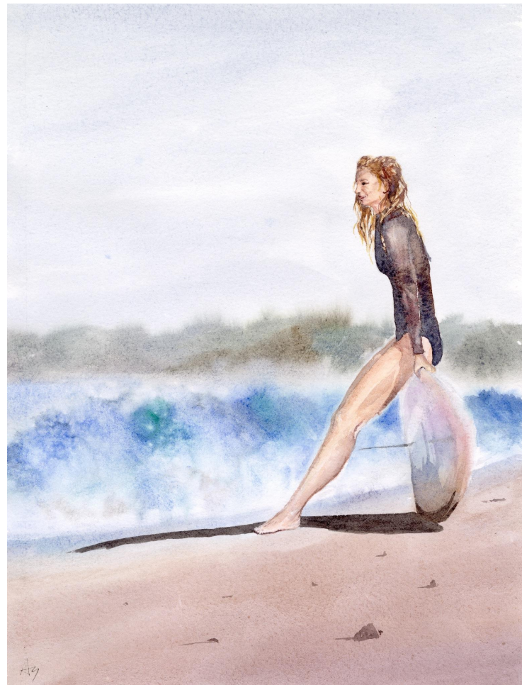
'Truly in the moment' 28x37 cm, watercolour