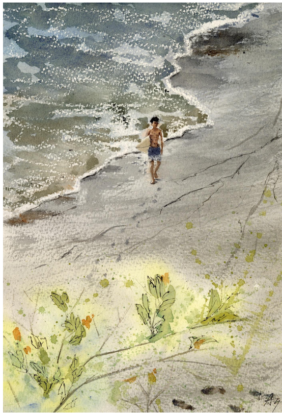
'After surfing' 13x18 cm, watercolour