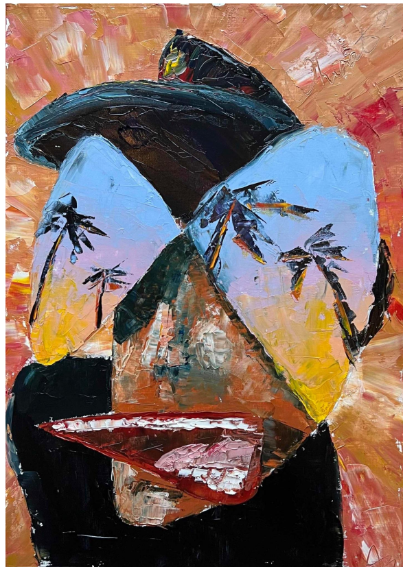
'Whaaat?!' A3, oil