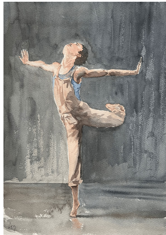
'Spin baby, spin' 26x36 cm, watercolour