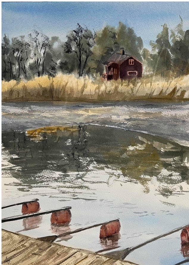
'Munkkiniemi' 26x36 cm, watercolour